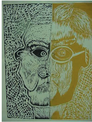
Figure 1: A self-portrait by a Filipino-Japanese teenager.

Although not nearly as bewildering for multi-ethnic people themselves as it can be for those around them, multi-ethnicity seems to be something of a paradox. How can a person be both Japanese and non-Japanese? To many, the term ‘multi-ethnic Japanese’ itself seems illogical. A paradox consists—by definition—of two co-existing qualities that appear contradictory but on deeper consideration express a